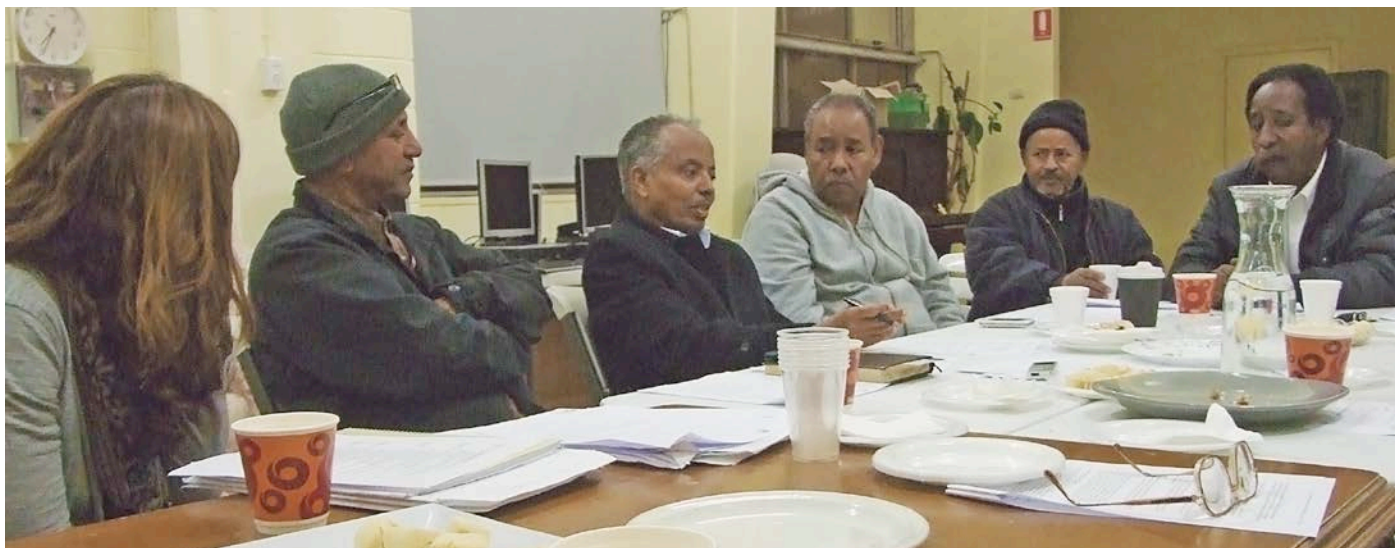
Focus group discussion with men from the Eritrean community, October 2013

were also recruited through community associations, including the Eritrean Community Association and the Somali Women's Association in North Melbourne.