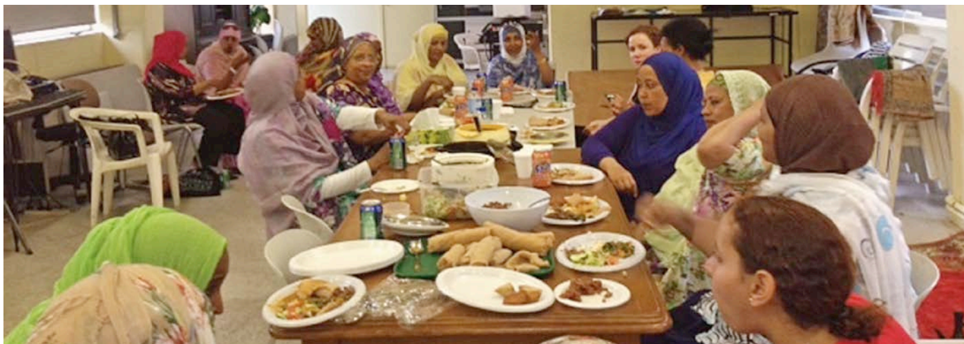
Consultation with women from the Hararian community, March 2013

An effective community-based approach to research on FGC is complex, time-consuming and sensitive. This was particularly true for this project – planned community consultations to establish whether the relevant communities thought that the project was warranted happened to coincide with substantial media coverage of FGC in Australia.